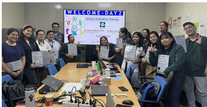
Understanding the Basic Requirements of Sensory Evaluation for Mang Inasal Philippines, Inc., Royale Cold Storage North, Marilao, Bulacan, September 18-19, 2024