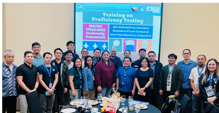
Customized Training on Proficiency Testing Provision and Training on the Conduct of Intra/Interlaboratory Comparison for GIZ Philippines - Department of Energy, Seda Hotel, Bonifacio Global City, Taguig, September 10-13, 2024