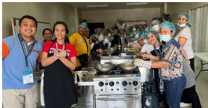
Livelihood Training ( Raket sa Masa ) for DOST-NCR (PAMAMARISAN), San Juan Skills and Livelihood Training Center, Brgy. Corazon De Jesus, San Juan City, September 17, 2024