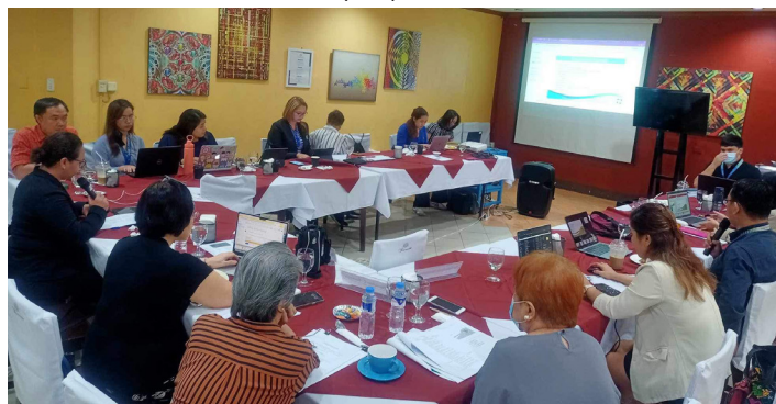
4th Philippine Dietary Reference Intakes (PDRI) Expert Committee Meeting, College of Home Economics, UP Diliman, Quezon City, September 19, 2024