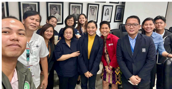
Special Meeting of the Philippine Nutrition Cluster, National Nutrition Council Central Office, Taguig City, September 12, 2024