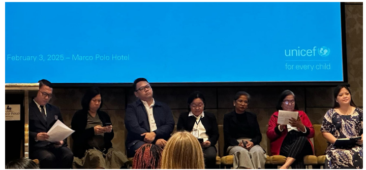
The DOST-FNRI presented its nutrition priorities at the Country Programme for Children (CPC9) Outcome Review Meeting with Government Partners on February 3, 2025 at the Marco Polo Ortigas Hotel, Pasig City.