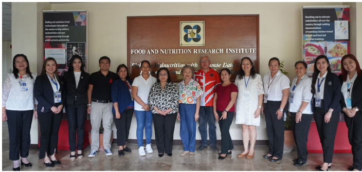
The Camarines Norte State College – Queen Pineapple Research and Development Institute (CNSC-QPRDI) visited DOST-FNRI on February 3, 2025, for a benchmarking activity on best practices in food and nutrition research and development.