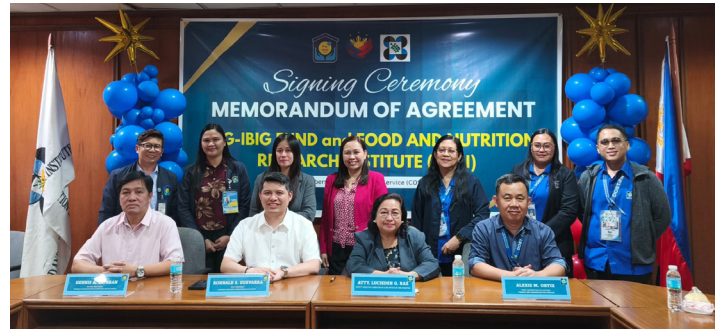
The DOST-FNRI and Home Development Mutual Fund, also known as the Pag-IBIG Fund, officially signed a Memorandum of Agreement (MOA) on February 11, 2025, at the DOST-FNRI Building, DOST-Compound.