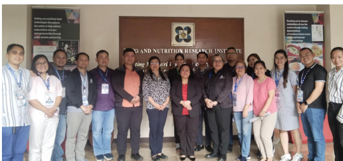
The DOST-FNRI successfully passed the ISO 9001:2015 Quality Management System (QMS) Surveillance Audit conducted by TÜV Rheinland on February 14, 2025, at the DOST-FNRI Building, DOST-Compound.