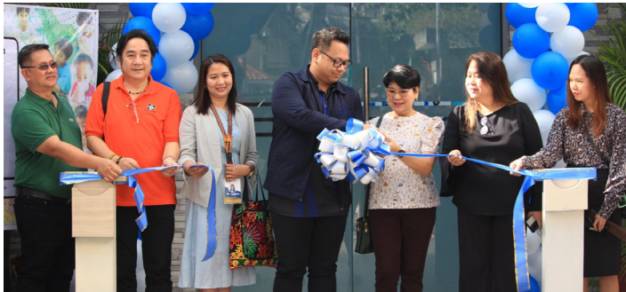
The DOST-FNRI participated in the 2025 School-Based Feeding Program (SBFP) Nutritious Food Products (NFP) and Milk Suppliers' Expo and Mapping held on February 10 - 14, 2025 at the DepEd Philippines Ecotech, Cebu City.