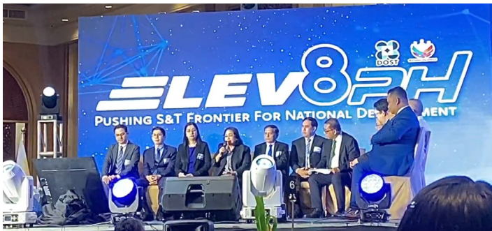
The DOST-FNRI showcased its commitment to driving Philippine R&D forward at the DOST's "ELEV8PH: Pushing S&T Frontiers for National Development" launched on February 5, 2024 at Dusit Thani Manila.